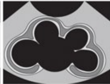
SFU grade 4

Uniformly dilated minor calyces, parenchyma spared