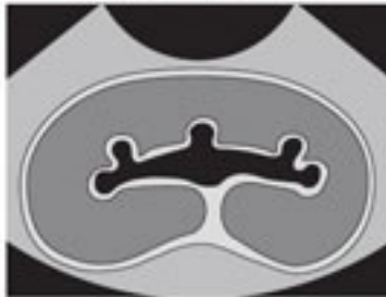
SFU grade 2