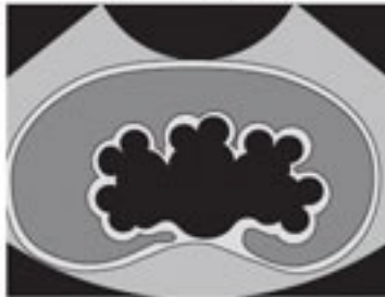
SFU grade 3