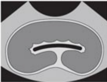
SFU grade 1