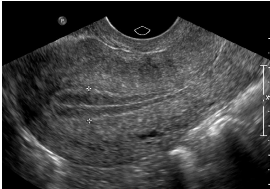
Figure 1. Measurement of endometrial thickness. The endometrial thickness measured in its thickest portion from echogenic to echogenic border (calipers) perpendicular to the midline longitudinal plane of the uterus.